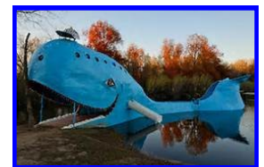
THE BLUE WHALE