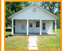
Mickey Mantle Statue & Boyhood Home