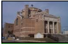
St. John's Greek Orthodox Church