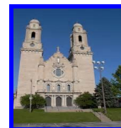
St. Cecilia's Spanish Cathedral

A UNIQUE MULTI-CULTURAL HOLIDAY EXPERIENCE!