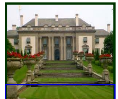
Nemours du Pont Mansion & Gardens