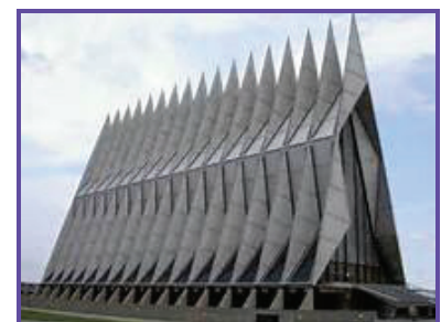
AIR FORCE ACADEMY CHAPEL